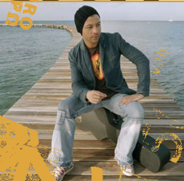
Christophe Mae and Warner Music have a partnership deal based on diverse revenue streams.