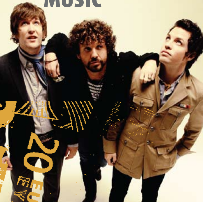
An Australian success story – Eskimo Joe.