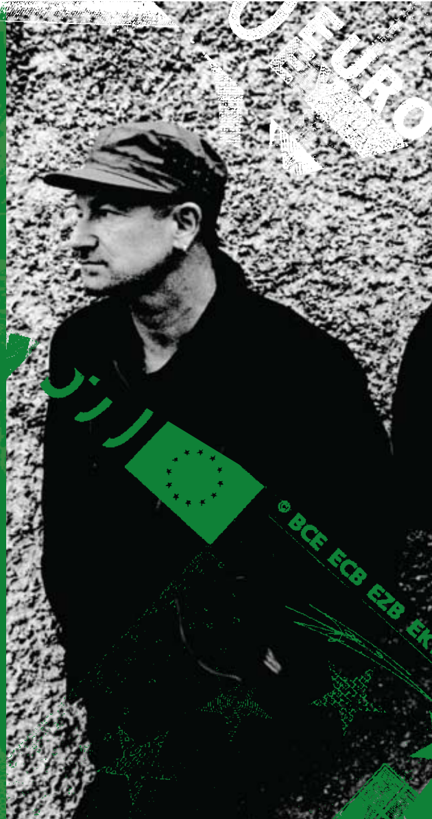
Above: Many top performing live acts like U2 have benefited from long recording careers.