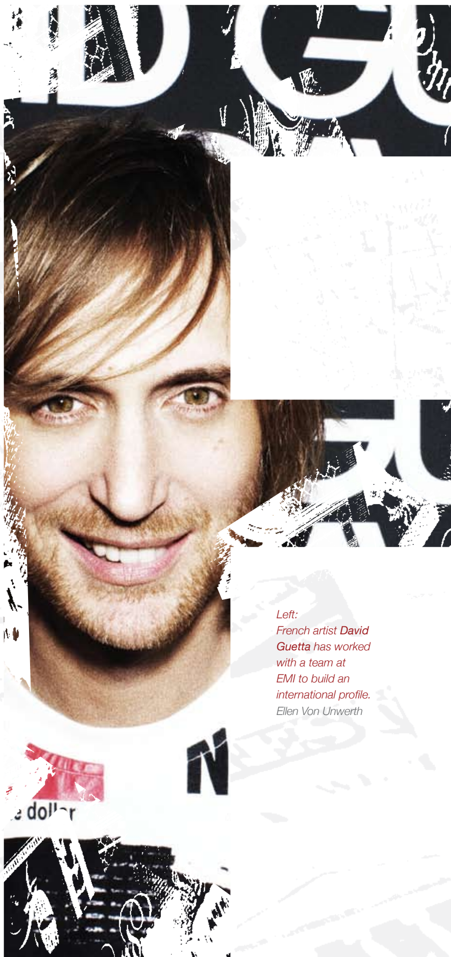
Left: French artist David Guetta has worked with a team at EMI to build an international profile.